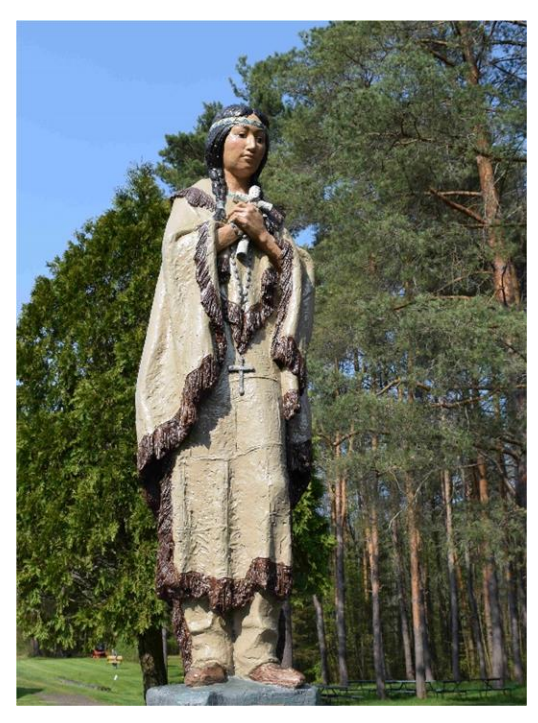
Saint Kateri's original habitat at her National Shrine in Fonda. NY.

SAINT KATERI CONSERVATION CENTER Wading River, NY 11792